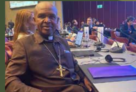
Advocacy at the UN