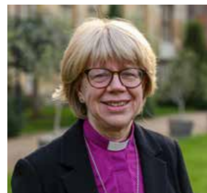
The Archbishop of Canterbury