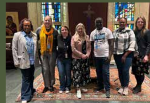
UN Status of Women