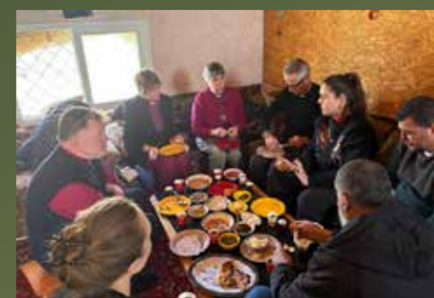
Pastoral support and advocacy