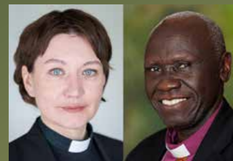
Anglicans and Lutherans speak out about migration and refugee crises around the world