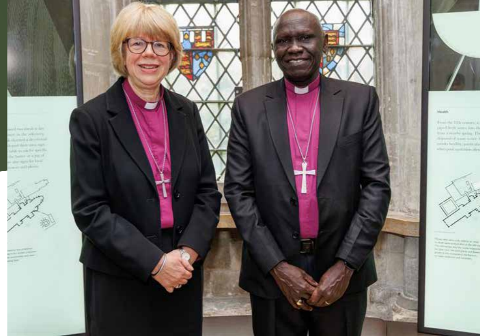
The Archbishop of Canterbury with The Secretary General of the Anglican Communion.

In October, the Secretary General shared a Pastoral Letter, calling for all Anglicans to uphold the unity of God's church. An extract urges: 'Every Anglican, and indeed every Christian, should seriously seek to discern a future of faithfulness according to God's own calling and enabling of our confession and obedience. In the Gospel of John, Jesus calls his disciples to unity in the truth and identifies himself as the means and the end of both. Divisions among Anglicans, and many other divisions in the Body of Christ, are sadly well known, as we see in the Scriptures (1 Cor 11:17). These divisions require urgent attention and repair, by means of every instrument available to us.'