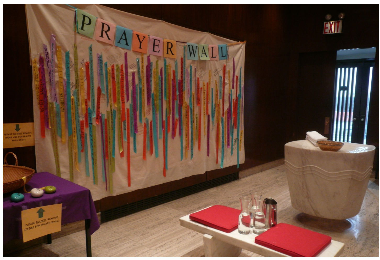
UN Church Centre Chapel 'prayer wall' made up of ribbons of prayer written during CSW58

This journey of personal transformation into wholeness is one our faith calls us to undertake, and must be integral to our contribution to the common work for justice in our world. Exploring how we enable this journey more fully in practice feels like the next step in my own participation in this work.