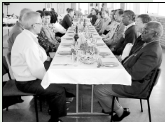
(far left) Tour of Marae in Auckland. (above) Members of APJN enjoy hospitality at a local Marae.

We spent the night in the marae. If you can imagine all of us, men and women, slept together on mattresses placed on the floor. The mattresses were arranged along the wall, with space in the middle so we could move about. We also had to leave our shoes outside because we had entered a holy place. At the marae, I woke up during the night and heard all the breathing and snoring of the people, and I actually had a very deep sense of being inside a living