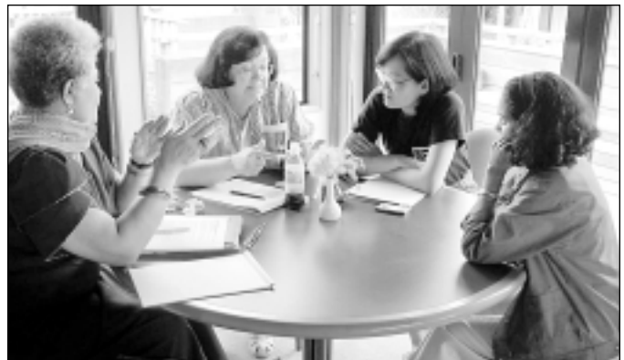
APJN women caucus

Therefore, the APJN recommends to the ACC that it must take seriously its actions and responses to peace and justice issues as they are directly related to women by establishing a Women's Justice task force as part of APJN. The task force would monitor all justice issues such as abortion, prostitution, slave trade of women, labor and commerce, domestic violence, rape/sexual abuse of girls and women, and HIV/AIDS from women's perspectives.