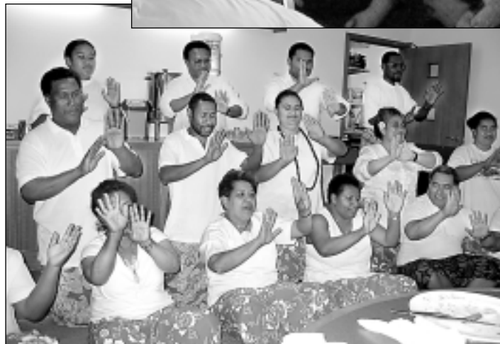
Dances of Polynesia are offered at APJN's closing celebration. (above) Waimamaku Elders