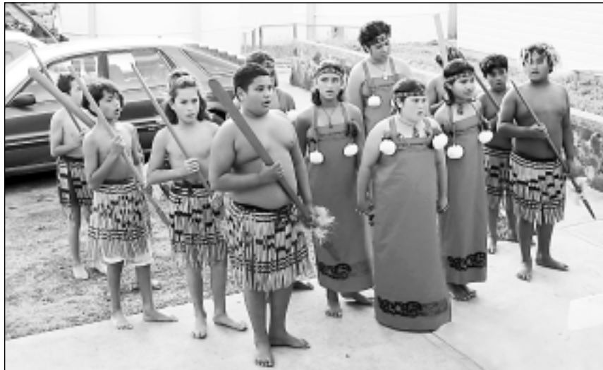
Young people greet APJN during a field trip.

We will propose to the Anglican Consultative Council meeting that resources be made available to revive the International Anglican Youth Network by allowing, as a first step, a meeting of young people in the Global South, which can be followed by a broad consultation of young people in the Communion.