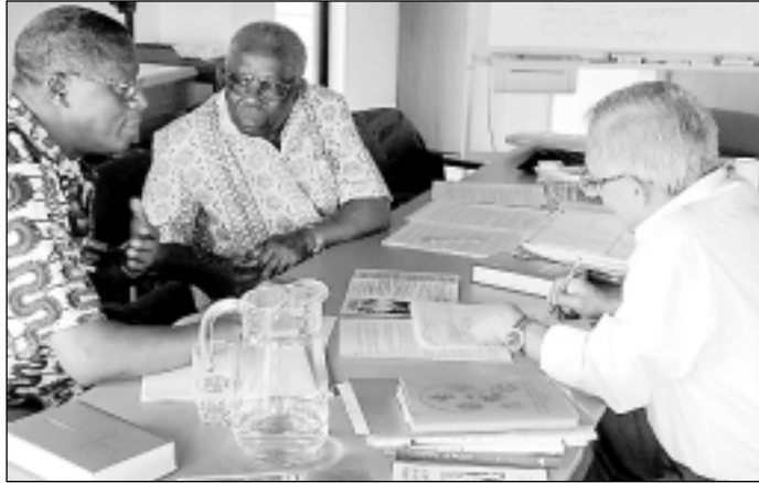
APJN Children's Committee

In solidarity with kindred church organizations, institutions, congregations, communities, and partners-in-mission within and out-