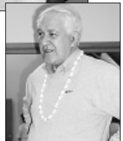
Moments from the APJN Gathering (from top to bottom) Anglican Cathedral, Auckland. Visiting Tane Mahuta. Members of the APJN try their hand(s), and feet, at a local dance. Archdeacon Faga Matalavea, Anglican Observer at the United Nations, shared local culture with the APJN members. Bishop Sir Paul Reeves, retired Primate of Aotearoa, New Zealand and Polynesia, and former Anglican Observer at the United Nations, visited the APJN representatives.