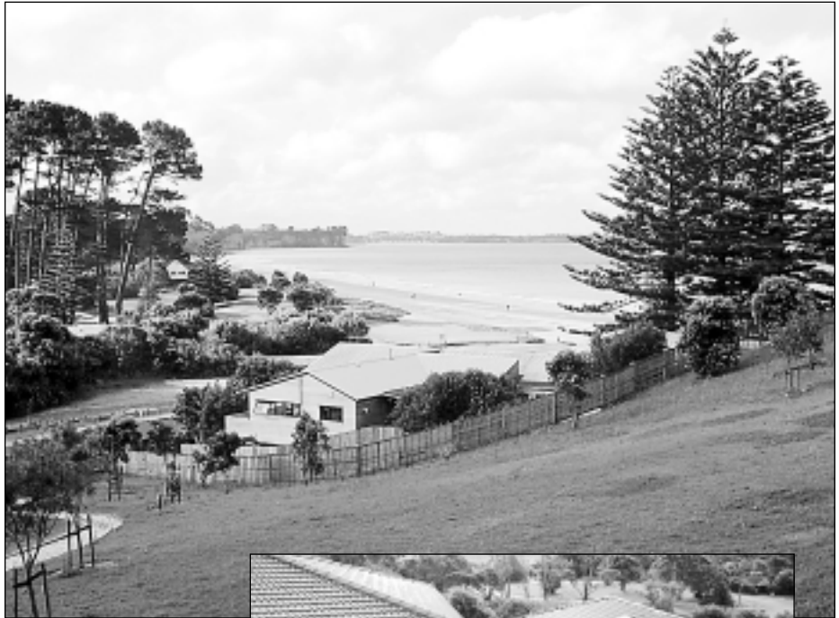
View from Vaughn Park Conference Center, home of APJN meeting