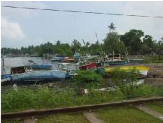
Tsunami Devastation in Sri Lanka, December 2004

Most of the world and the churches of the Anglican Communion have been painfully aware of the devastating earthquake and tsunami in South Asia on December 26. Sri Lanka and Indonesia were the worst affected countries, but parts of India - Tamilnadu, Andhra, Kerala, and the Andaman and Nicobar Islands - were all affected.