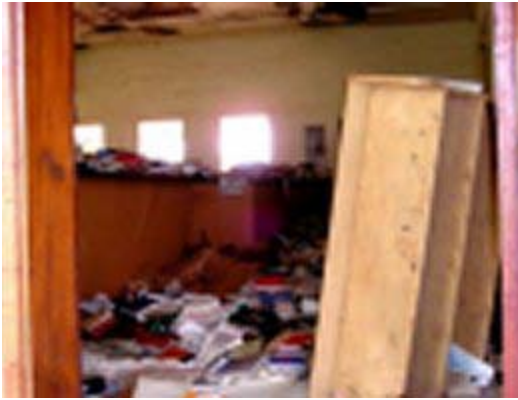
Plundered library, Cuttington College, Liberia