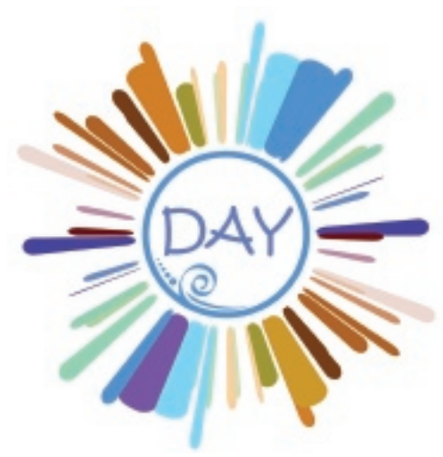
Domestic abuse and exploitation: bringing young people out of the dark and into the light of DAY

forgetting. However, forgiveness is a revolutionary act which makes the person forgiving stronger not weaker, and is not the same as saying the consequences of a person's actions do not matter.