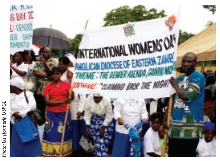
Claim back the night: Anti-violence campaign for International Women's Day in Zambia.