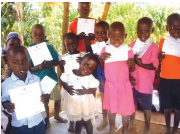
Ugandan children proudly show off their birth certificates.