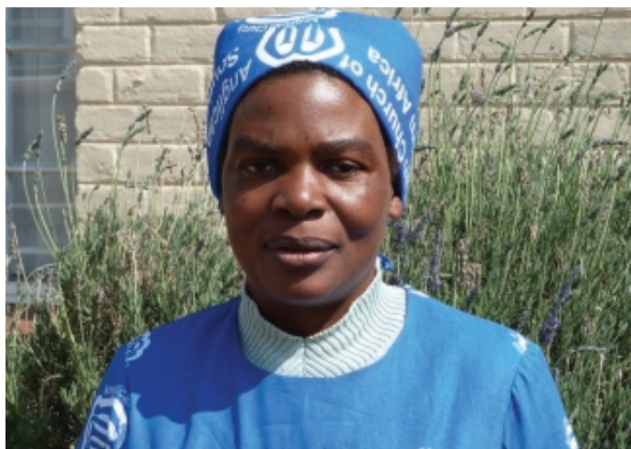
Mothers' Union worker.