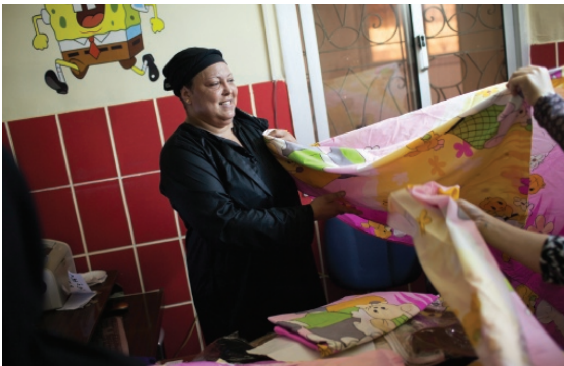
Successful business woman.