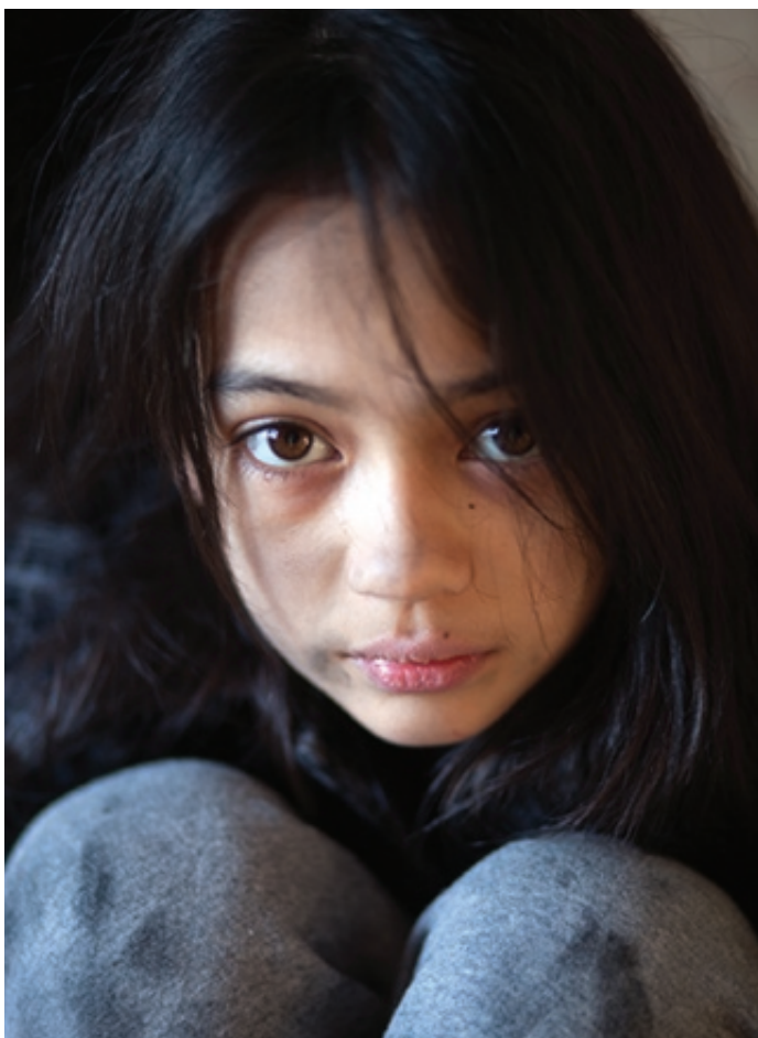
Photograph modelled for The Children's Society.