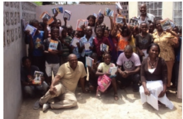
Children supported by the parish of St Barnabas.

It had been a concern for the Church that with most of the children under the school age, when they come for baptism, it is discovered that they have not been registered. So parents are sensitised to take them to a registration office in order to get a birth certificate. In the Bible it was predicted that, “The Lord will write a list of the peoples and include them all as citizens of Jerusalem” (Psalm 87:6). People grow from children to adults living out of the dump; boys and girls having the dump as their meeting place, where they work, play and fall in love, resulting in having children born of unregistered parents. Living without a birth registration means that even if they can begin the first school grades, they will stop somewhere because they cannot write examinations without the documents, cannot access work, basic services such as electricity, water, SIM card registration.