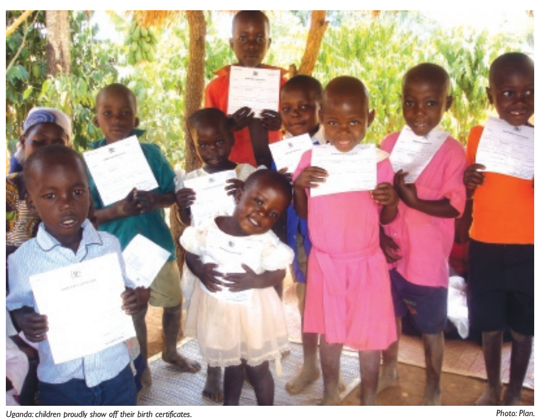
Uganda: children proudly show off their birth certificates.