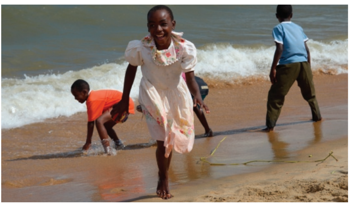
Children playing by Lake Malawi - are they registered?

Like most African countries, Malawi has a lot of children. Close to 65% of the population is youth. Our fertility rate is one of the highest in the world. An average family has six children. Unlike most African countries, Malawi does not have registration for its adult citizens, much less for its children. In a world where child trafficking and all kinds of abuse happen, this is a situation with serious consequences for children. The good news is that attempts are being made with the help of Plan International and UNICEF. Strangely, the Church has not been recruited in this exercise. I say strangely, because for a long time