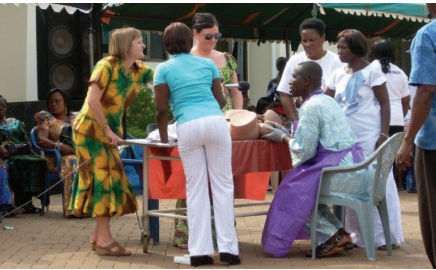
Training birth attendants.