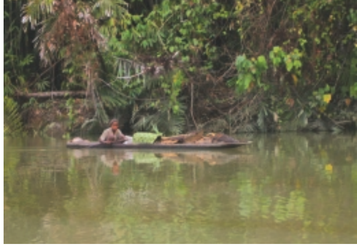
Woman rowing her canoe along a big river to a clinic to get antenatal care.

It is estimated that there are about 260,000 births every year in Papua New Guinea, but only 1% of them are registered with the Registrar of Births and Deaths, even though if your birth is not registered this can cause problems for you later on in life when you want a passport or to apply for a scholarship or training overseas.