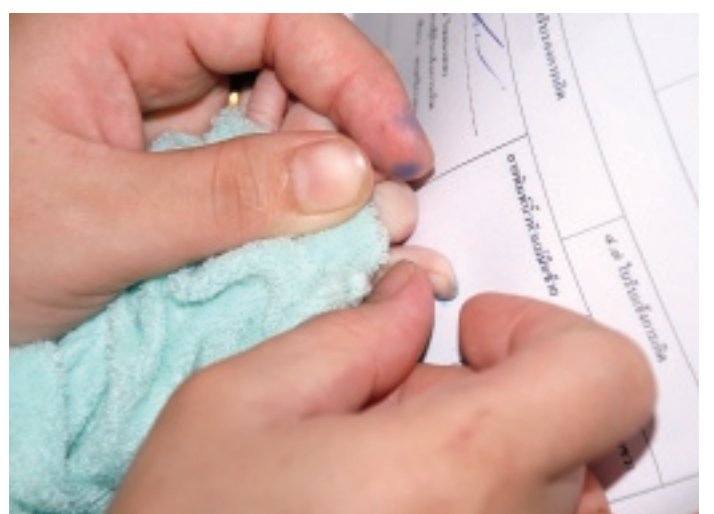
Baby's finger prints being taken for birth registration process.