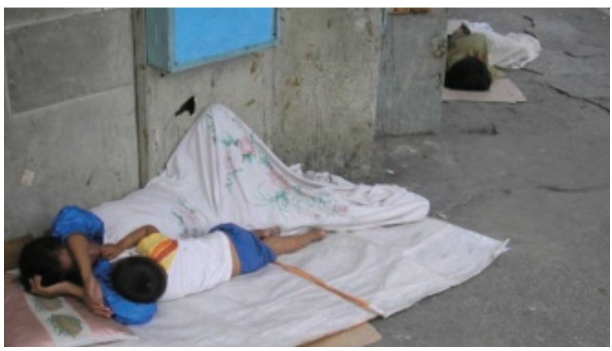
Manila street children