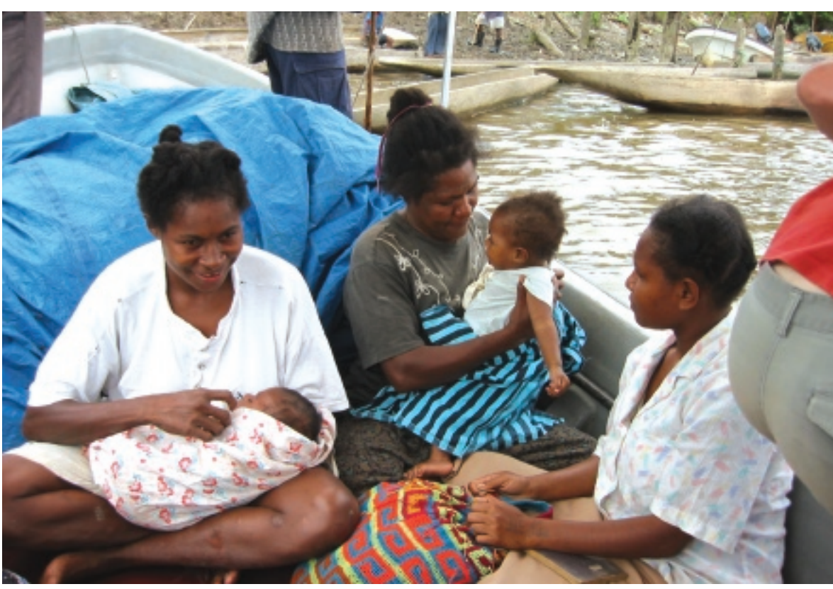
Three women taking their newborn babies to the clinic for checks after giving birth at home the previous week