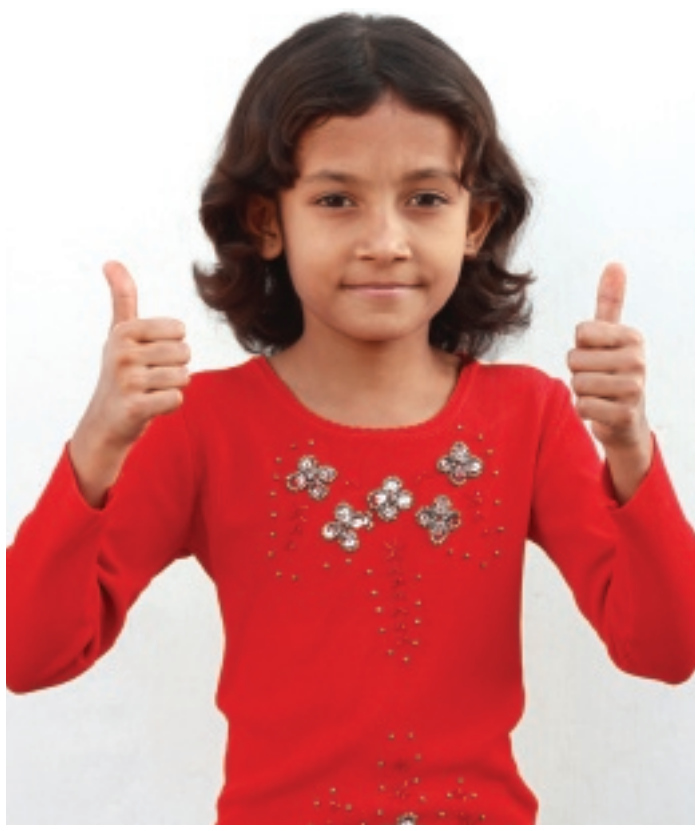
A better future - if she is registered.

Birth registration provides the right of name and nationality and helps a child to secure the rights to his or her origins and also helps to safeguard other human rights of education and health. Nationality is one of the most sensitive and complex of aspects associated with birth registration. The registration system can help to protect children against illicit changes to their identity, such as change of name or falsification of family ties. If children are arrested, a birth certificate can protect them against prosecution as an adult and ensure that they receive any special legal protection that should be made available to juveniles. This is important even in relation to the most trivial crimes, but when it comes to serious crimes in countries where the death penalty is imposed, proof of age can mean the difference between life and death.