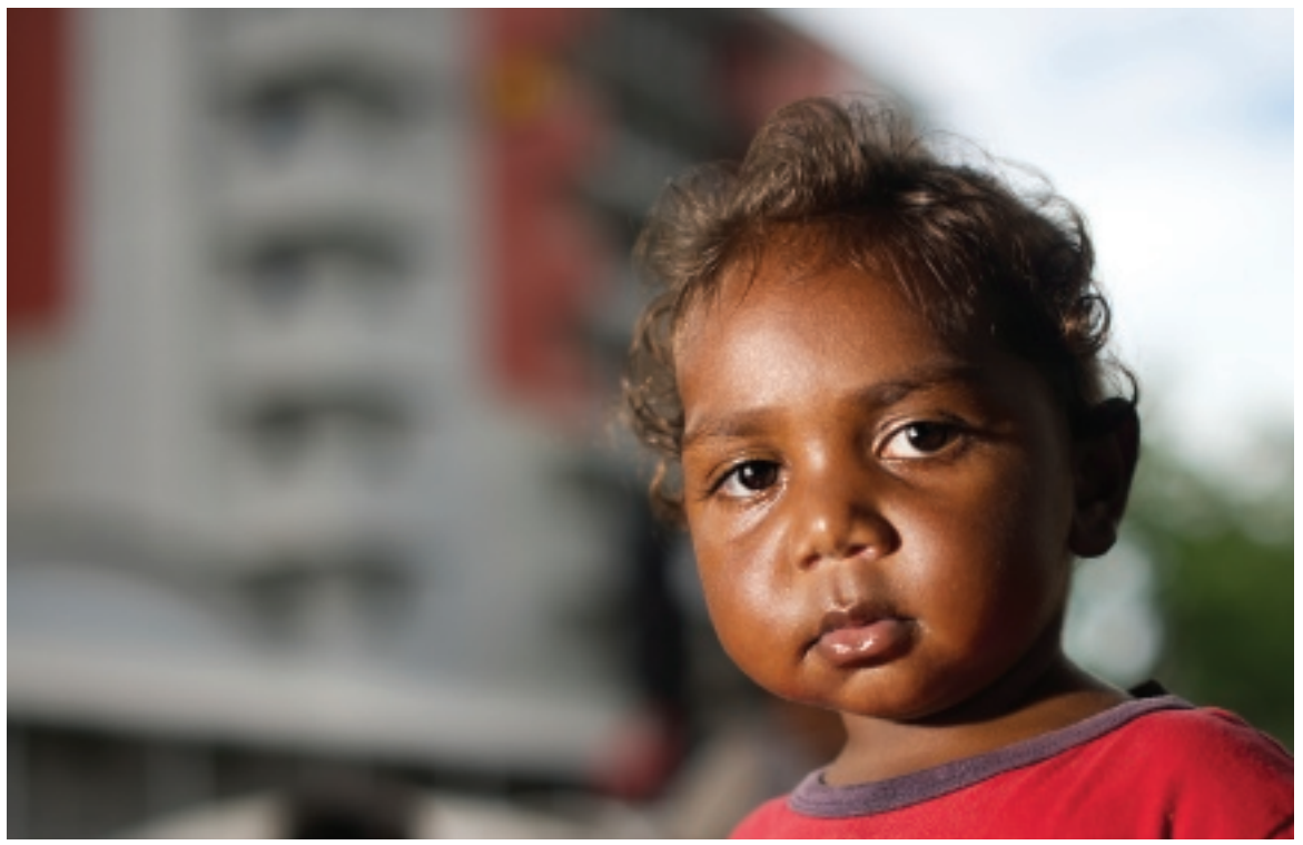
Little Aboriginal girl in Darwin.