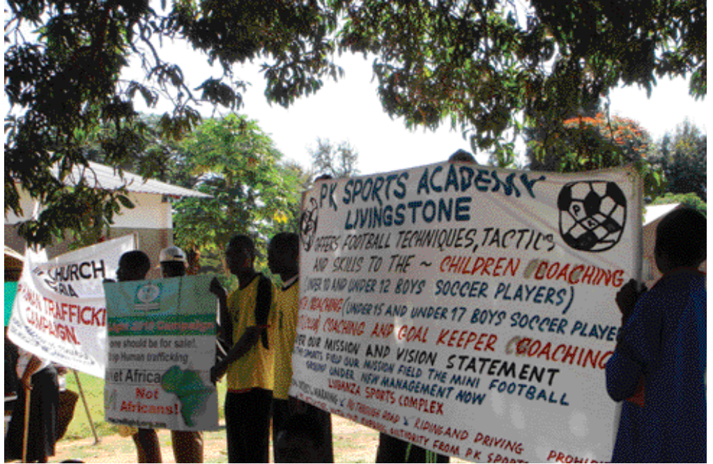
The March against human trafficking.

The Reformed Church in Zambia (RCZ) is carrying out a sensitisation campaign to help prevent the human trafficking of vulnerable people. The 2010 FIFA World Cup is finally here and as a Church we want to focus on the pervasive crimes expected to accompany the economic boom in the South African tourism industry. An expectation is that the human trafficking of women and girls for sexual exploitation and child labour will be on the increase and young men and women are likely to emigrate to South Africa in great numbers during this period. For Zambia, this World Cup in South Africa poses a threat to the safety of our children, youth, girls and women. Our campaign strategy is to create awareness in the community and particularly the marginalised and vulnerable.