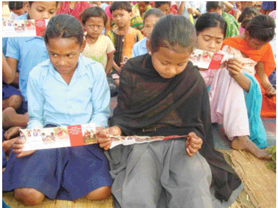
Girls looking at Daughter Project leaflet.

Nepal has a lot of unprotected border areas, particularly in the south on the open border with India. This is a prime point for traffickers to take children across undetected. Some of the most impoverished areas are also along the borders, meaning that there is a much greater risk of children being sold. Traffickers deliberately target the poorest communities, knowing that people are desperate enough to do whatever it takes to provide for their families. They trick parents into sending their daughters to work as maids or au pairs in the bigger cities, where they are instead held captive and put to work in bars and brothels.