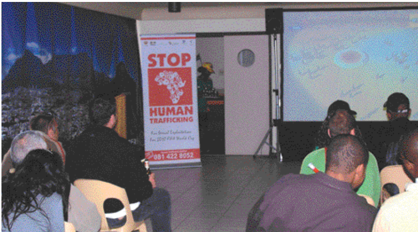
Raising awareness in Namibia.