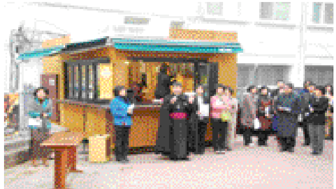
Support from the Church.

The third objective is to bring more balance between the regions by establishing GFS branches in Asian countries which do not have the GFS organisation and by strengthening the Asian GFS societies which have been working rather passively