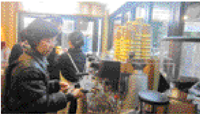
Well Side Café - providing refreshment.

The main objective of the project is assisting the women to settle down and adjust well in the new land by providing opportunities of communication and actual support by employing them at "Well Side Café".