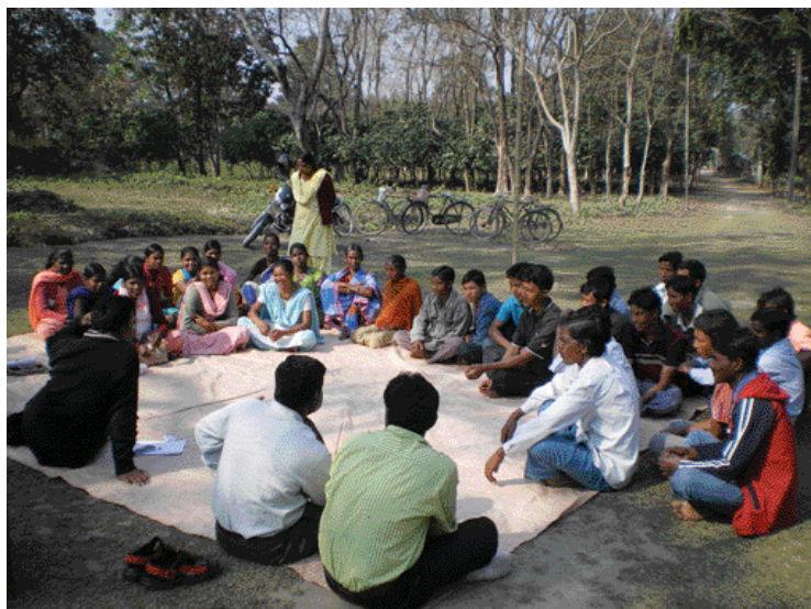
Teaching about trafficking.

Although trans-border trafficking is an affluent business for the traffickers, the legal documentation involved in crossing the borders of India has restricted the outflow of girls from India. But internal trafficking is a major issue. Young girls from economically backward areas, and girls belonging to the lower strata of the caste structure, are tricked to move out of their villages and families for jobs in cities as domestic helps. They are then forced into marriage, assaulted, raped and forced to enter the sex trade.