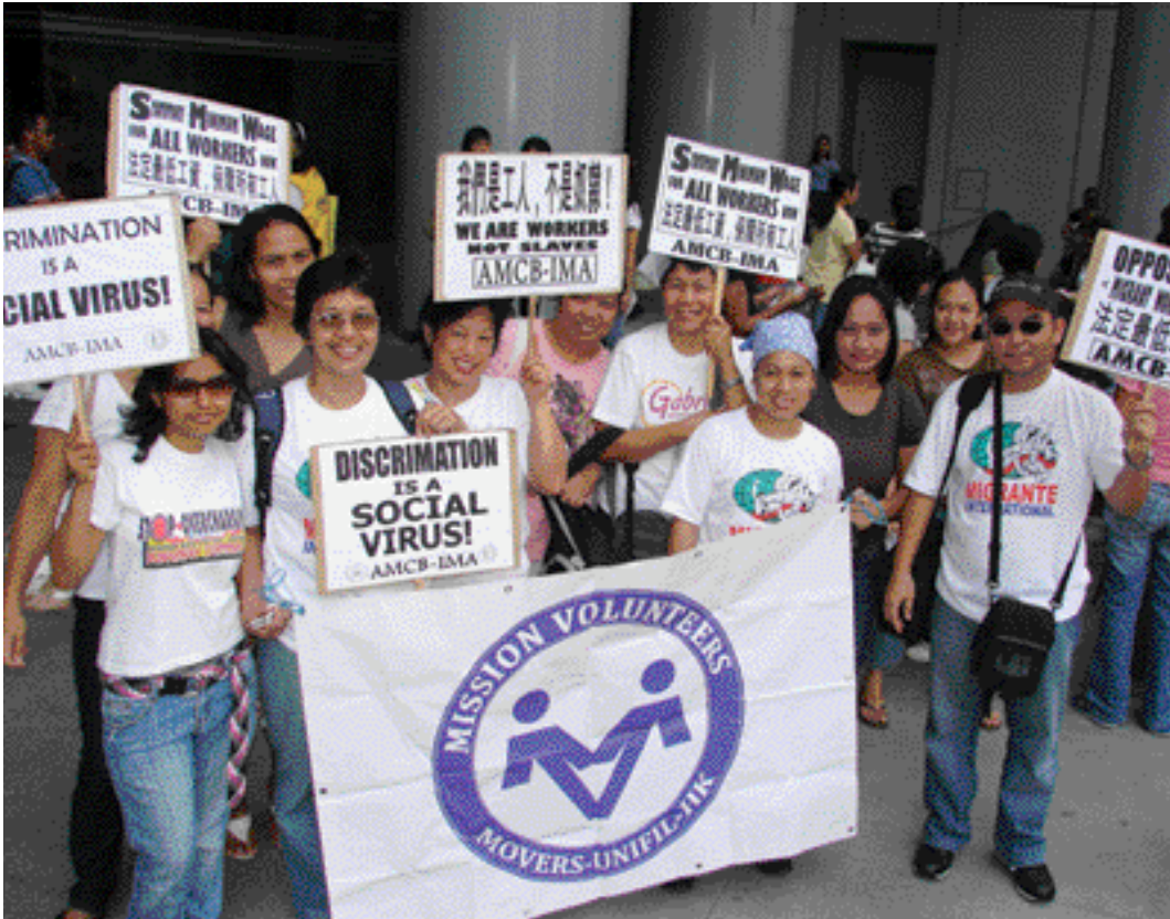
Carrying the message.