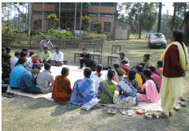
Hearing stories from returnees.

Vigilance cells have been constituted in each village, with the prime responsibility to track the outflow of their villagers, and assist in negotiating employment with the recruiter, inform the Police about such outflow, to ensure that migration is safe, and also ensure safety at the work place.