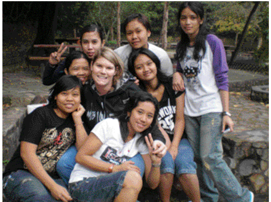
The support of friendship.

As part of the Episcopal Mission Volunteer Programme, I was sent to work as an intern for a year for the Mission for Migrant Workers and Bethune House. The experience has been both challenging and rewarding. My ministry involves a lot of listening to deeply tormented women. I cannot imagine being called to a more worthy place.