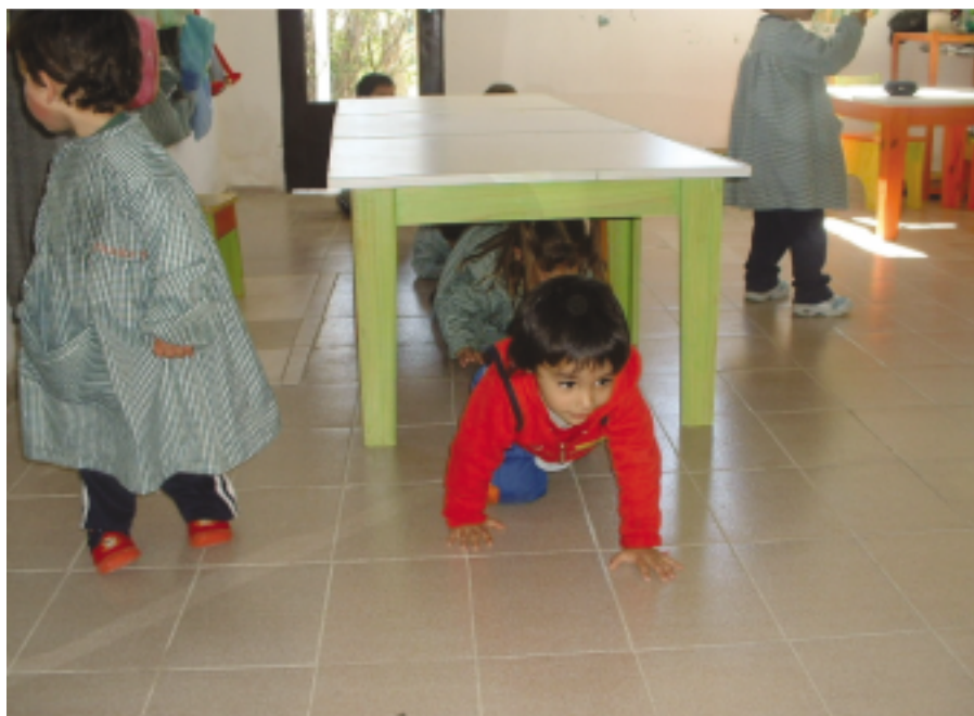
Early Years Education.