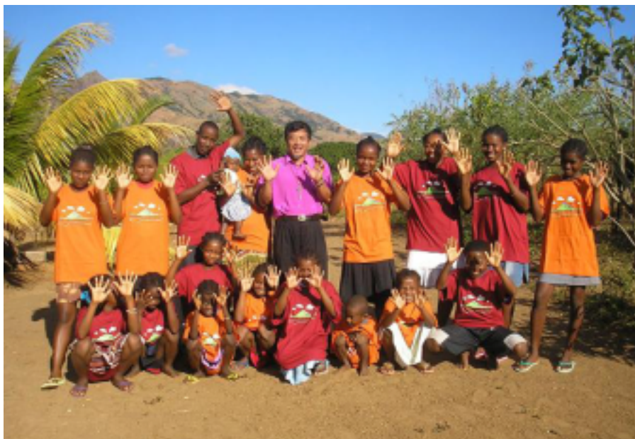
Happy children, Antsirana.