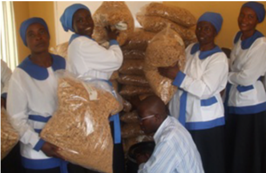
Willing workers help with the supplementary feeding scheme.