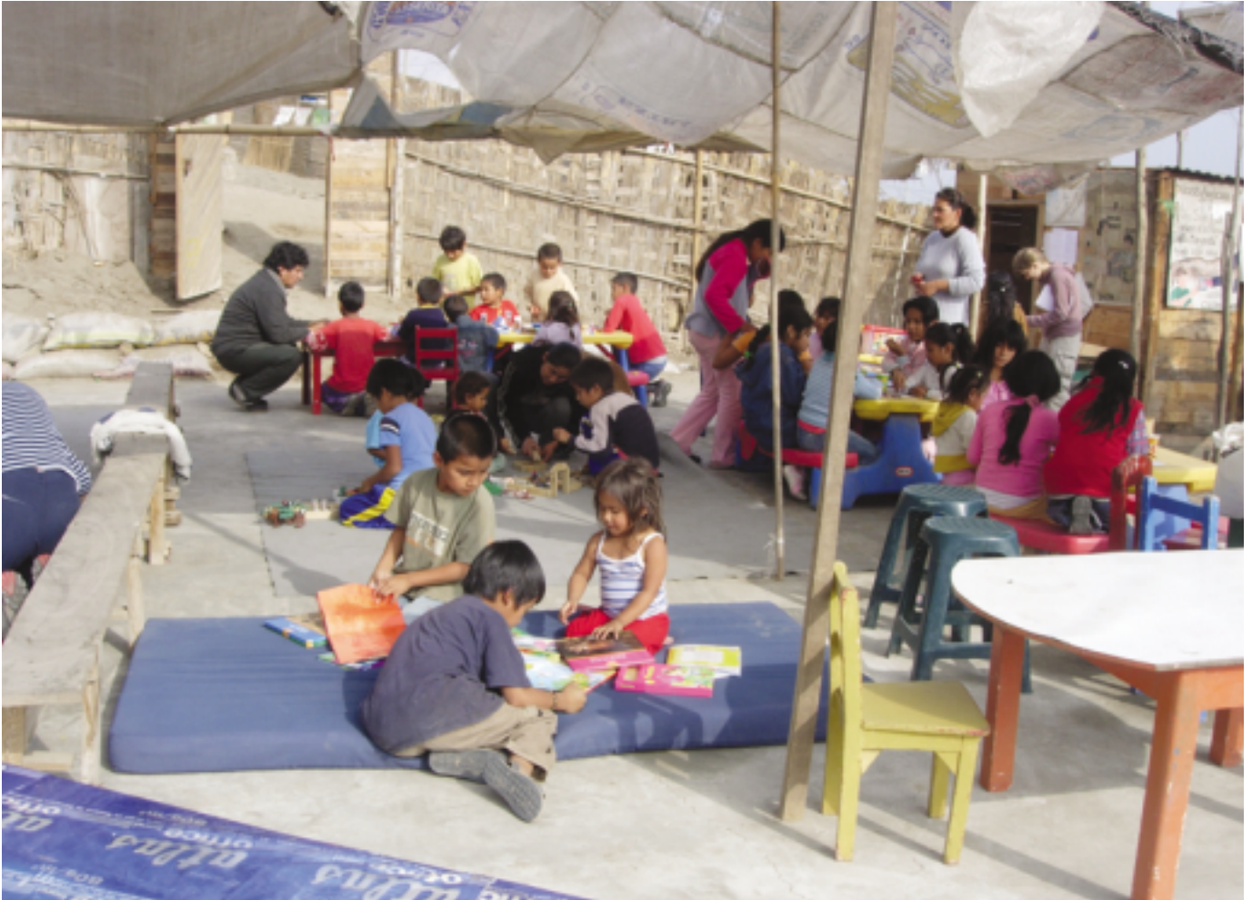
Child's play at El Arca.