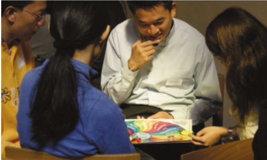
Feeling wheel board game.

In response to the terrible Sichuan earthquake, Hong Kong Sheng Kung Hui Ming Hua Theological College is working on a project to help children affected by such disasters. A workshop was set up for social workers and mental health professionals, led by a certified play therapist. It aimed at enhancing the participants' knowledge of children's post-disaster reactions using first-hand experience from games and exercises with young people suffering post-traumatic stress. Research has shown that children's reactions to disasters appear to linger and persist and are likely to cause much misery to them and their families. Some re-experience the events through recurrent thoughts or dreams about what happened, suffering intense distress at cues or reminders of the trauma. Others make great efforts to avoid thoughts or conversations about the event; they can have diminished interest in normal activities and feel detached or removed from other people. Difficulty sleeping or concentrating, as well as depressive reactions, are common. Increased fears – in young children fear of separation from parents or loved ones – or fears of loud voices,