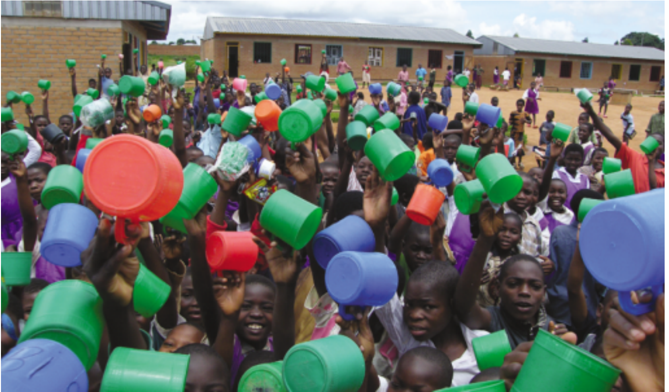
Joyful waiting for maize-meal porridge, Malawi.