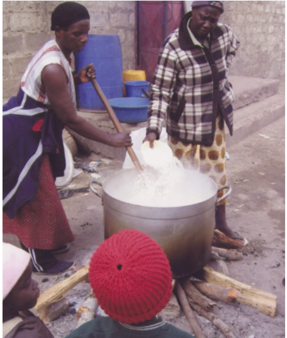
Cooking for children.

Recently, the Church has introduced literacy classes for adults. Almost 100% of the students in this programme are women. We believe that by educating the parents we are contributing to the welfare of children. Literate parents, particularly mothers, are better equipped to deal with challenges affecting children in urban settings. Through functional