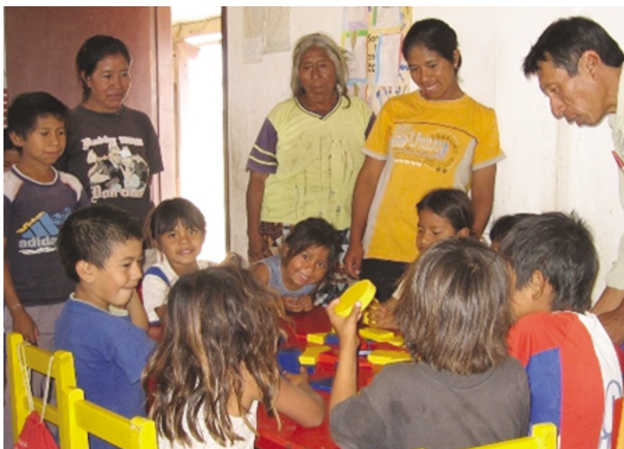
In class with new resources.