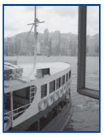
Ferry Boat - Hong Kong

CUAC needs to be informed of which one is the official delegate.