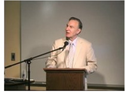
Watch videos from the Plenary Sessions at the Triennial by CLICKING HERE!