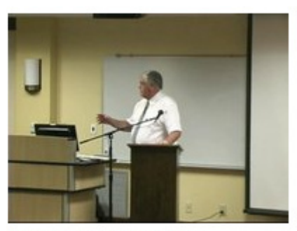
Third Plenary: Panel 3 months ago