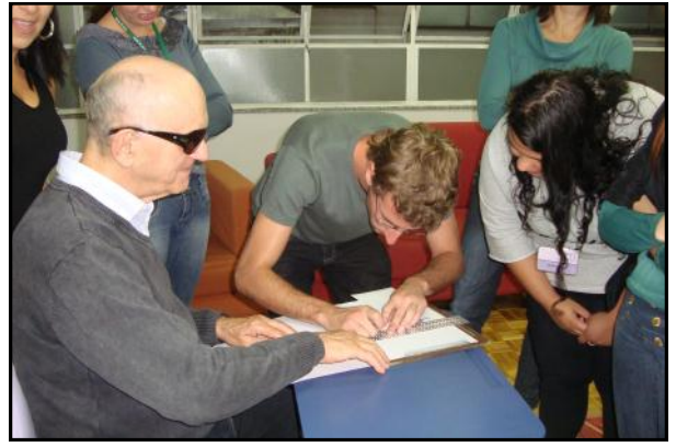
FAE students being introduced to a Braille text for the blind

Established in its present form in 2003, FAE traces its heritage nearly to the beginning of the twentieth century with the arrival, in 1916, of the first Anglican missionaries to the town of Erechim; a few years later, with a resident priest in place, a parish church was