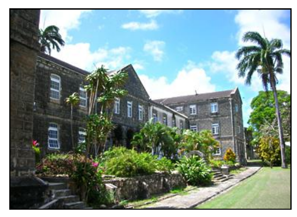
Codrington College, Barbados

While the College never produced any doctors, its lectures in philosophy and divinity helped prepare