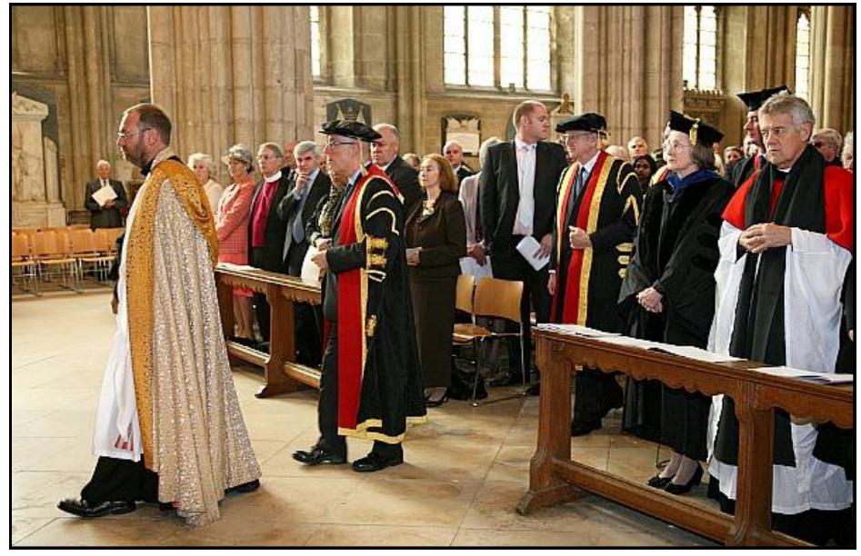
Jubilee Service of Thanksgiving

This year Canterbury Christ Church University is celebrating a landmark anniversary as it turns 50.