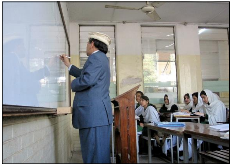
Biology class at Edwardes