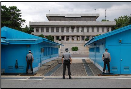
North meets South: The DMZ at Panmunjom

It is now the time for the United States to pursue new resolutions. Increasing pressures and sanctions are virtually ineffective by now, as the assumption of these actions were the change of regimes or collapse of society in North Korea. The U.S. government failed to implement the Geneva Framework, a result of their bilateral talks, and started six-party talks in 2003 as an alternative. [But] there were obstacles everywhere