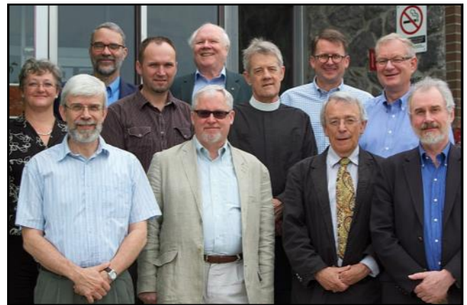
Thorneloe University in Sudbury, Canada hosted a number of Anglican presidents, principals, and deans for two days of productive discussions about the future of Anglican education in Canada, June 9-11, 2013. Included at the meeting were representatives of several CUAC member institutions.