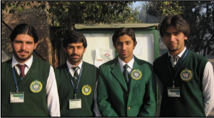
Edwardes students in school uniform

the academic performance of attendees. Edwardes offers ten undergraduate and graduate programs, and faculty development initiatives include collaborative leadership, active committees, skill seminars, and syllabus guidance.