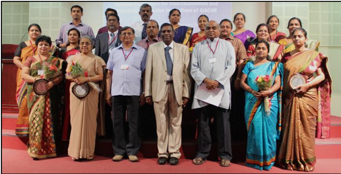
Principals of Christian Colleges in India, meeting in May 2013 in Bangalore

The meeting of the principals of Christian colleges in India was held at Bangalore from May 1 - 3, 2013. This includes all the principals, both Catholic and Anglican. Most of our member college principals have participated in that program. We met and discussed the future plan of the chapter meeting. The Dr Rowan Williams Annual CUAC Lecture at Lady Doak College on November 11, 2013 is a great privilege to our chapter; we are looking forward to that and we also plan to meet as chapter during that time. On September 22 - 26 we have a retreat for the principals of Indian Christian colleges at Port Blair (Andaman Islands), during which we will meet as the Indian Chapter and plan for the future and Triennial. ❖