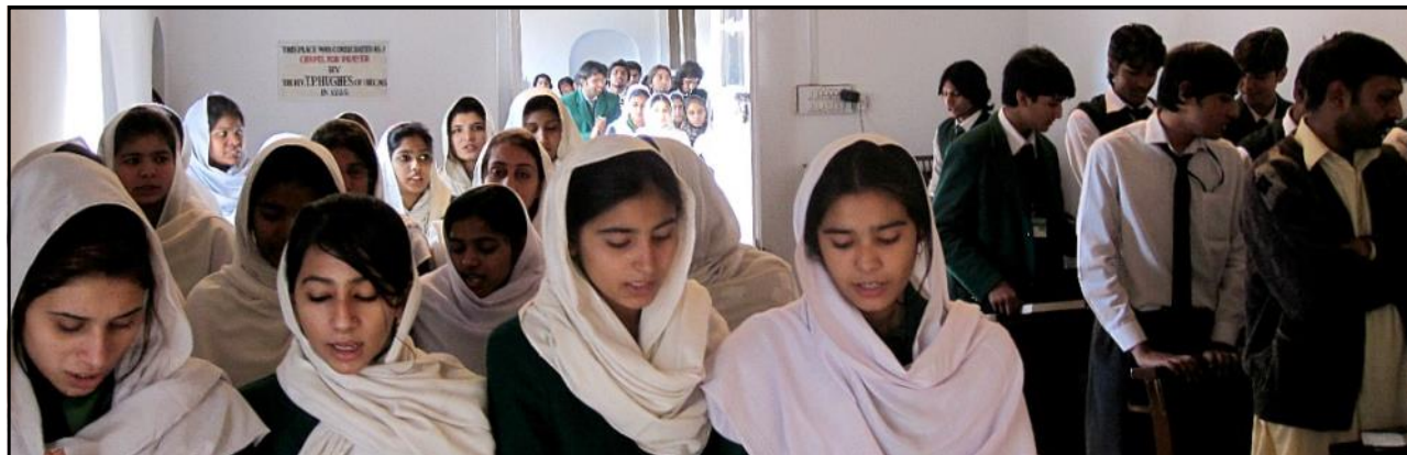
Christian Students at Worship in Edwardes Chapel

Pakistan's troubled northwestern border region might seem an unlikely place to look for an Anglican ethos; indeed, Edwardes College in Peshawar, the provincial capital of Khyber Pakhtunkhwa, is the only Anglican college in Pakistan. But for 113 years, Edwardes College has gone about doing what Anglicans naturally do: building bridges of understanding between communities. This conciliating attitude was no doubt a factor in a recent, significant, and some would say surprising, affirmation of the college's mission: a development grant in the amount of R$ 300 million (US$ 3.1 million) from the provincial government.