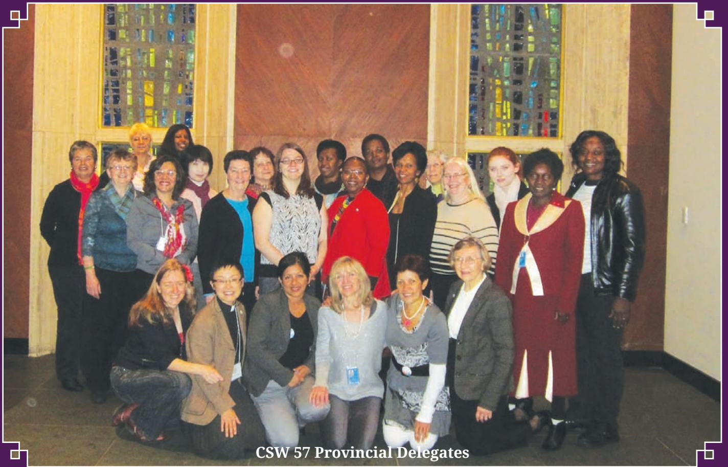
CSW 57 Provincial Delegates