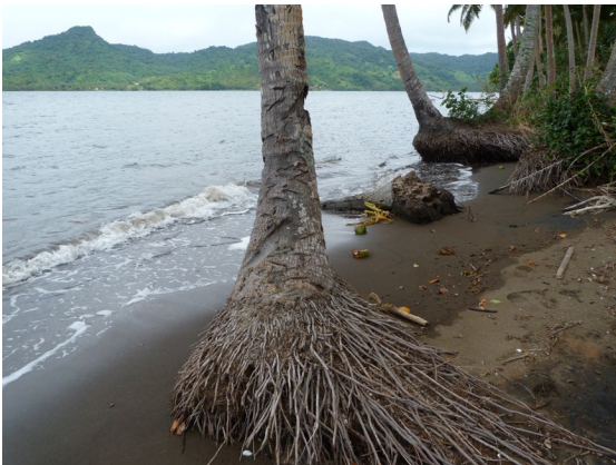
Buca Bay, Fiji