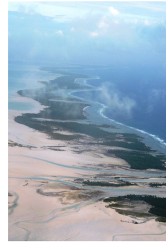
Northern Tarawa, Kiribati