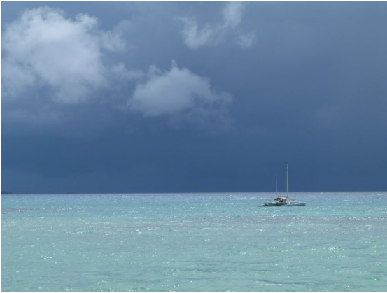
Approaching storm, Tuvalu