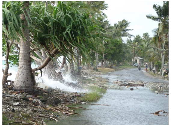
High tide, Tuvalu