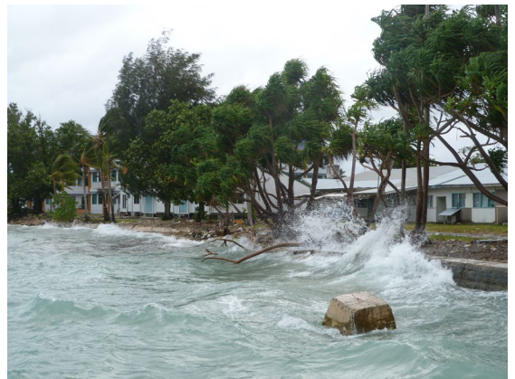
High tide, Tuvalu