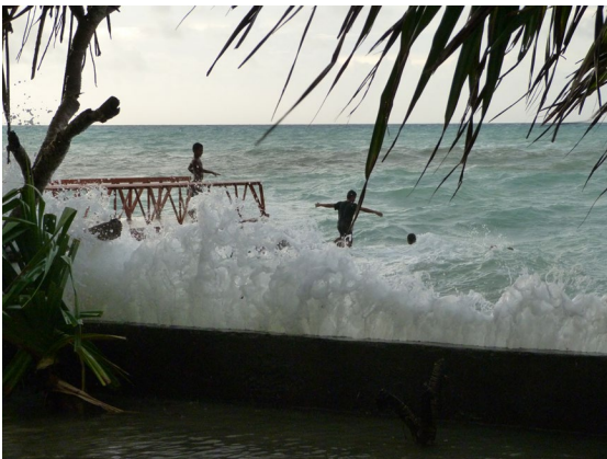
Rough surf, Funafuti - hotel jetty