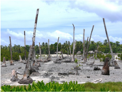
Man-made but not climate change, Kiribati