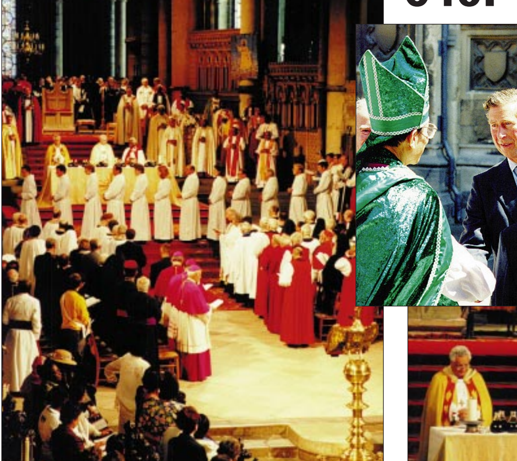
by Nan Cobbey

With gold and blue banners flying, schoolchildren waving and the Canterbury Cathedral's 14 bells tolling, the 13th Lambeth Conference opened yesterday morning as 750 cassock-clad bishops representing 37 provinces processed into the cathedral to celebrate the first Eucharist of their three-week gathering.