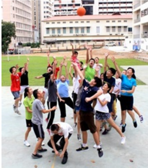
Wesley Methodist Church, Kuala Lumpur