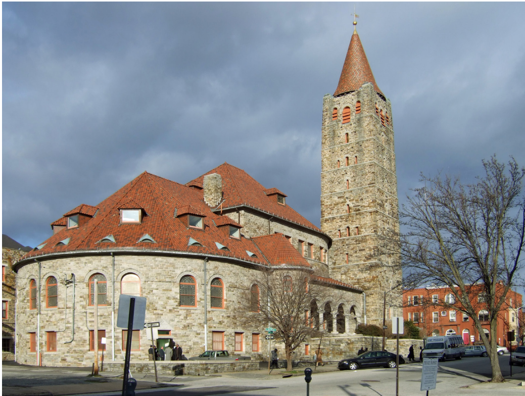
Lovely Lane Chapel, Baltimore, USA, site of the Christmas Conference of 1784. John Wesley had reluctantly agreed to the American Methodists' desire to organize their own church. He sent Thomas Coke to supervise the process and to consecrate Francis Asbury as "general superintendent" of the Methodists in America