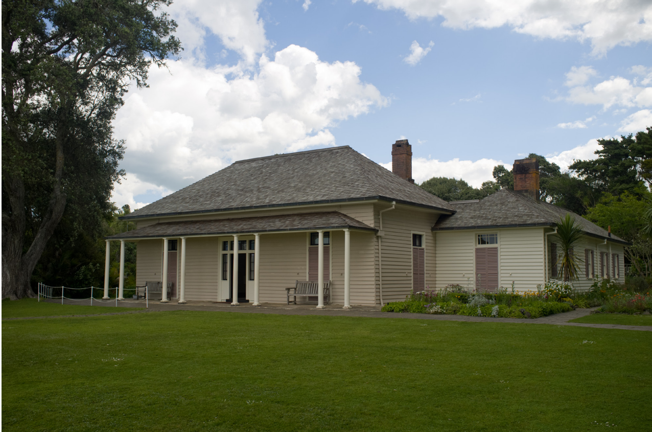
Waitangi Treaty House, North Island, Aotearoa-New Zealand