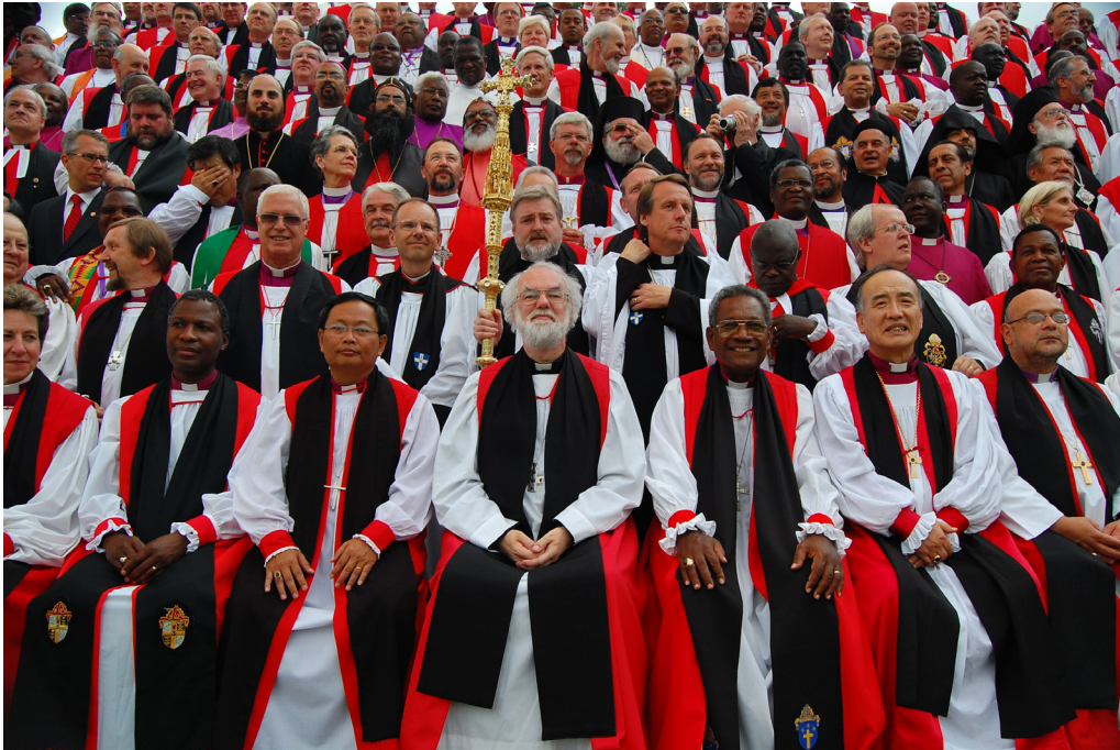
Bishops in communion: The Lambeth Conference 2008