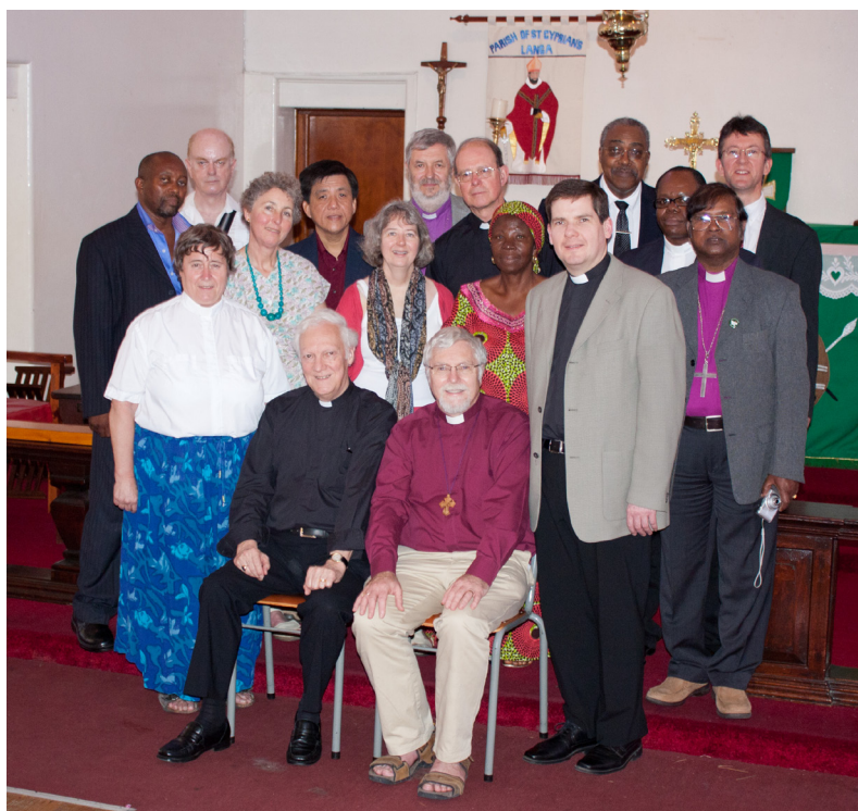
Members of AMICUM in St Augustine's Church, Langa, South Africa