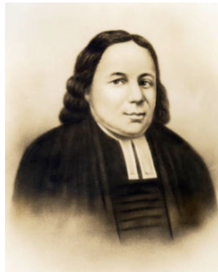
Thomas Coke 1747–1814